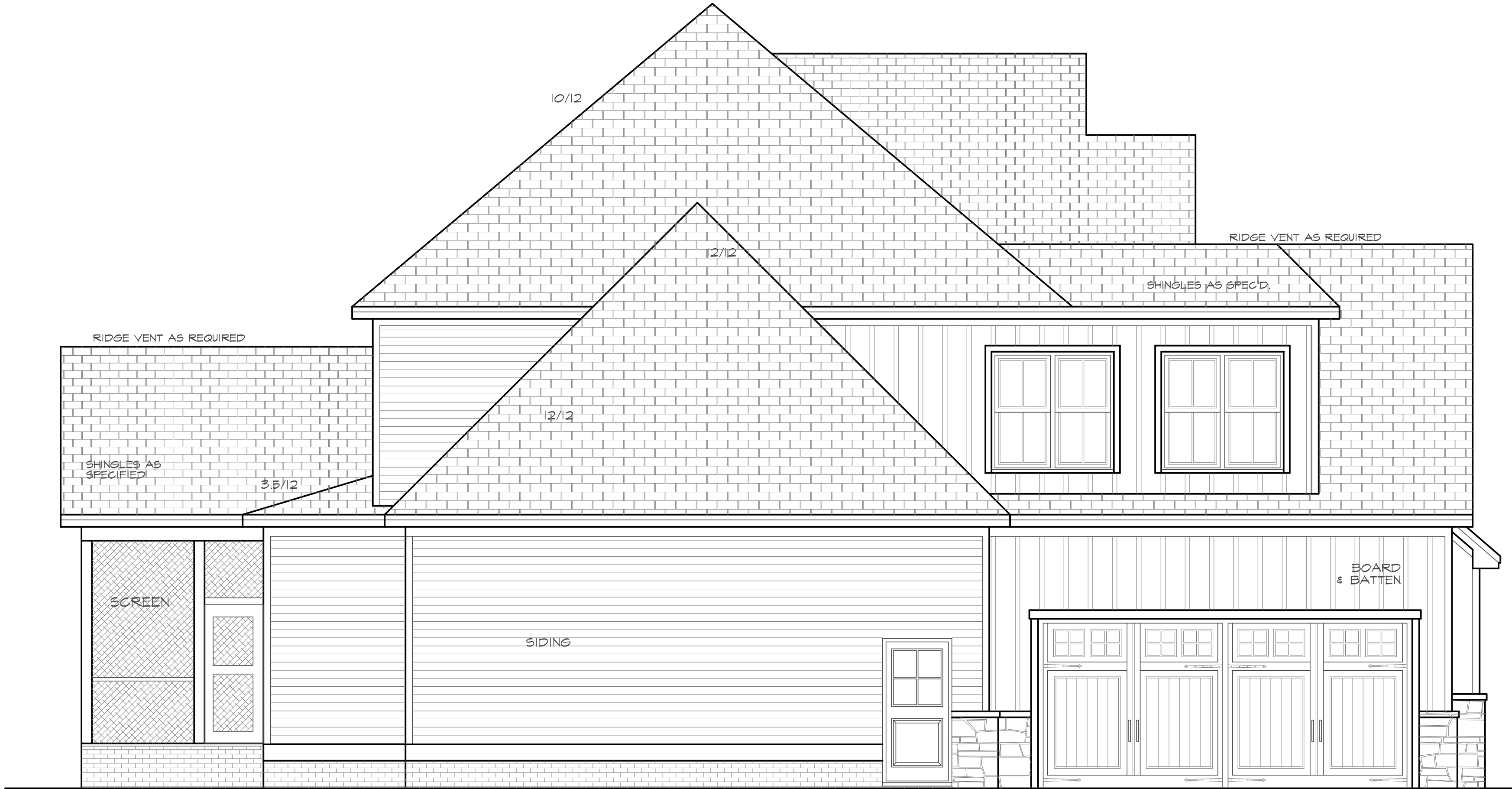
LEFT SIDE ELEVATION SCALE 1/4" = 1'0"

MidTown Designs Inc. 1529 Big Falls Dr. Wendell NC 27591 Phone: 919-783-8626 www.midtowndesigns.com