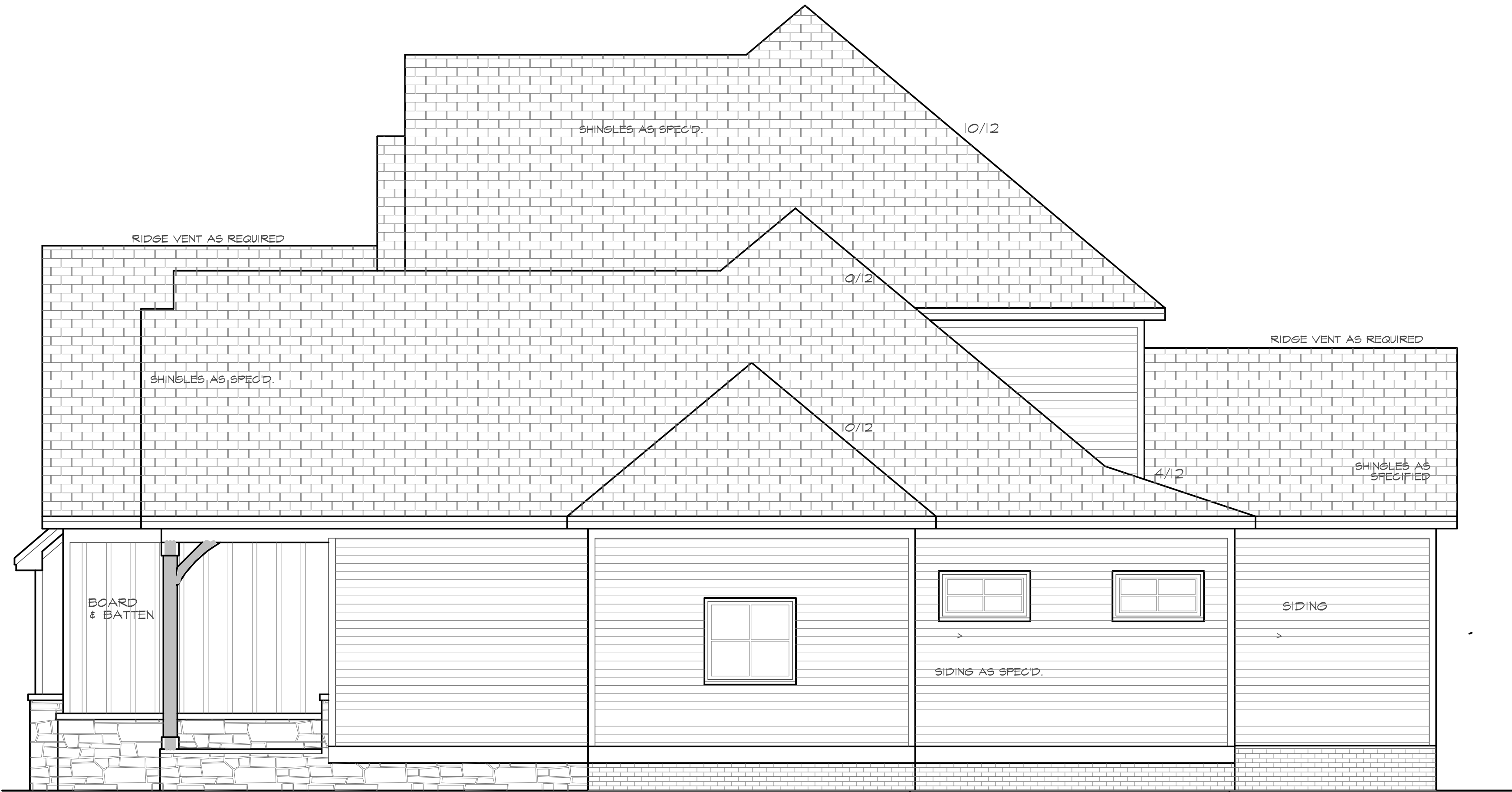
RIGHT SIDE ELEVATION SCALE 1/4" = 1'0"